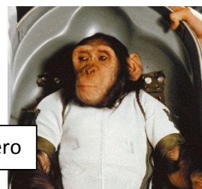
Ham the Chimp: American hero

Extra for experts: Look up the difference between democracy and communism. What are the main ideas about how to live?